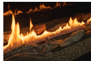
optional ceramic logs or white stones (installed on top of the burner)